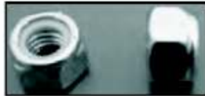
P22 - 8MM - Qty. - 8 NOS.