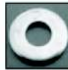
P22 - 9MM Qty. - 8 NOS.