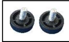
P31 - 19X6MM Qty. - 4 NOS.