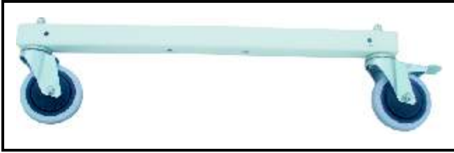
P4 - Size - 640X40X40MM - Qty. - 2 NOS.