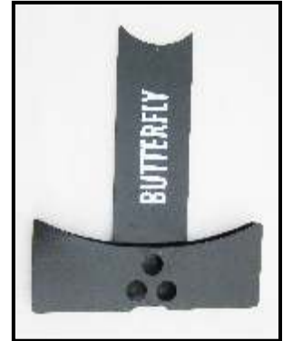
P19 - Qty. - 2 NOS.